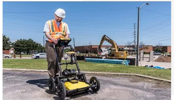
GPR Ground Penetrating Radar Utility Mapping.