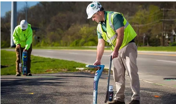
Underground Utility mapping & locating.

We have a wide range of underground locating services based on your needs. Here are just some of the techniques and technology we have at our disposal